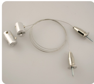
CDAZC10 Side Mounted Cable System C