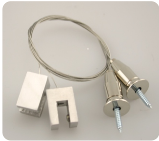
CDAZB10 Top Mounted Cable System B