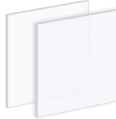
Bright White #2406