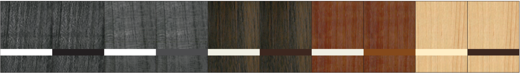
TN9X2-192 Carbon Ash/ White TN9X2-194 Carbon Ash/ Black TN9X2-162 Barnwood Grey/ White TN9X2-168 Barnwood Grey/ Charcoal TN9X2-172 Natural Teak/ Ash TN9X2-178 Natural Teak/ Brown TN9X2-022 Brazilian Cherry/ Ash TN9X2-028 Brazilian Cherry/ Copper TN9X2-134 Beechwood/ Ivory TN9X2-138 Beechwood/ Brown